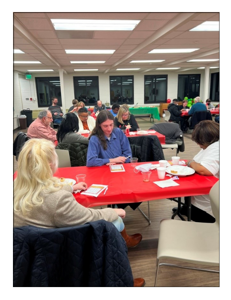
Lots of prizes were given out as people won their Bingo games and everyone had lots of fun!